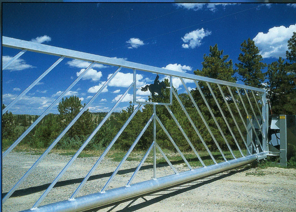
DCM-25 115 volt AC with DC battery backup

Tilt-A-Way vertical pivot gates are designed to meet the security and aesthetic objectives for all commercial security requirements. Engineered to withstand severe weather and high winds, Tilt-A-Way represents the unparalleled security expertise and commitment to quality required by discriminating installations such as airports, military, FAA, municipalities, nuclear plants, courthouses, gated communities, mini storages, and residential properties.