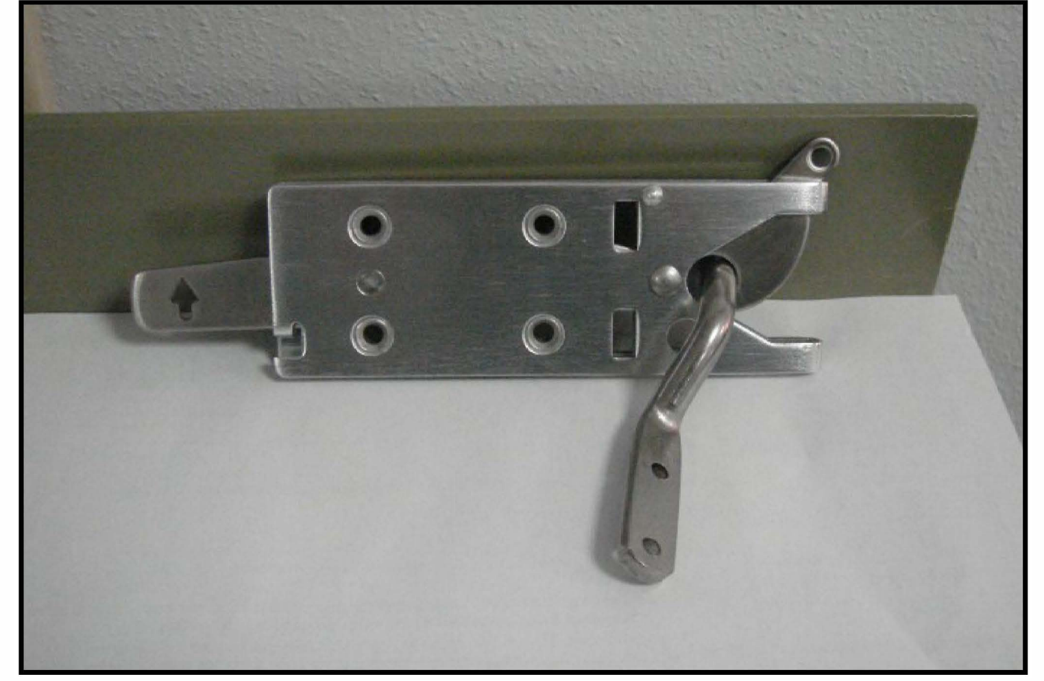
ALUMINUM & STAINLESS STEEL GATE LATCH (BY STANLEY)