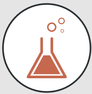
CHEMICAL STORAGE AREAS

HERE'S WHERE "THE FORCE" CAN BE WITH YOU