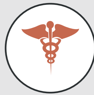
HOSPITALS, E.G., OXYGEN STORAGE AREAS