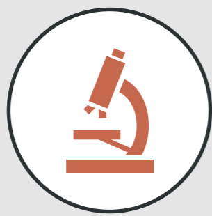
LABORATORIES, RESEARCH AREAS