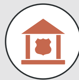
POLICE AND FIRE STATIONS